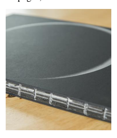
The Angry Bat 96 pages, 180 mm x 220 mm, 300 copies, publisher: The Angry Bat